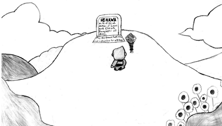
Art by Charles Frederick

"Oh, Buta-Mask / Hinawa" is an ultimate chimera of two pieces representing two very different aspects of Mother 3 . The two themes in "Oh, Buta-Mask" follow King Porky's