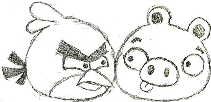
Art by Isabel Martinez

No person would cast pearls before swine, or in the case of birds, eggs before swine. Birds are thus rightfully angry when swine try to steal their eggs. Passive-Agressive Avians channels the art of six-year-old arguments to share the context of the popular mobile game Angry Birds , where birds must combat pigs trying to steal their eggs. Pitting fluttery flutes against ominous brass, this arrangement is sure to be a hoot (and a squeal).